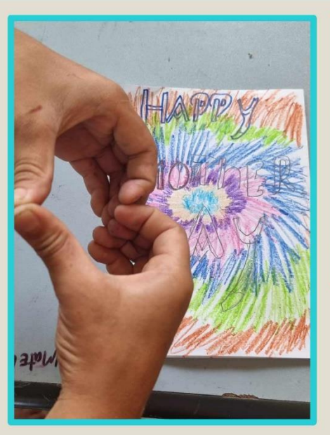
FROM SAMOA Kids miss us while we are in USA