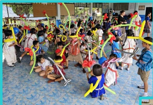
We taught the balloon class at Life Church in Missouri, and they went to Thailand ! The fruit of balloon ministry in Thailand! 132 children saved! Loved getting these pictures while we are here in USA.