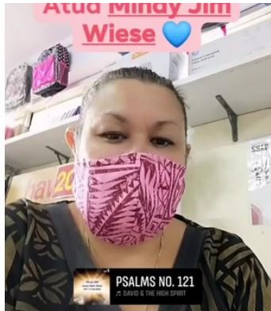
OUR FRIENDS AT SSAB SAMOA STATIONERY AND BUSINESS BIBLE STUDY AND FRIENDS