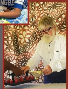
PREACHING THE GOSPEL, TEACHING, LAYING ON OF HANDS. SERVING! ITS ALL ABOUT JESUS!