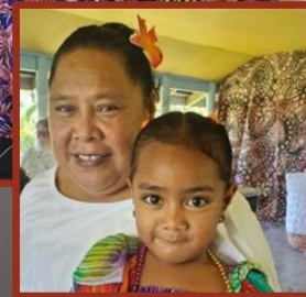
MOTHER'S DAY GREAT HARVEST CHURCH OF GOD SAMOA