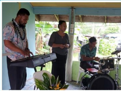
GREAT HARVEST CHURCH OF GOD WORSHIP