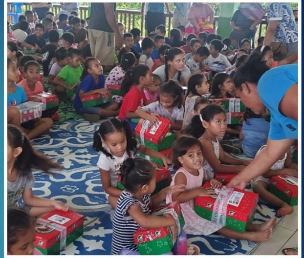
Operation Christmas Child Samaritans Purse Shoe Boxes Greatest Gift and Greatest Journey