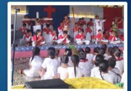
Easter Program at School Aele Fou Primary