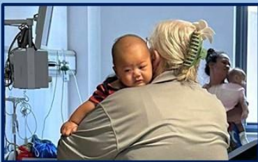
Faith Angels Foundation Hospital Ministry We have witnessed so many answers to prayer