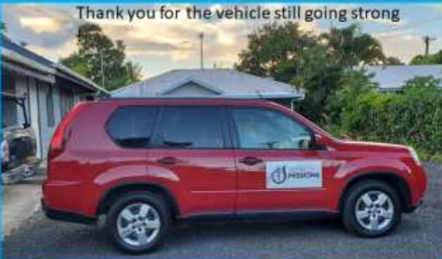
Thank you for the vehicle still going strong