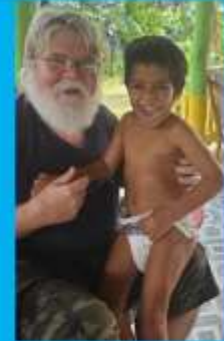
Eddie a miracle!