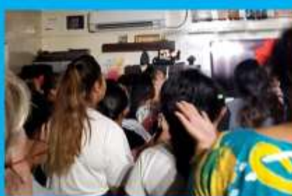
A Visit to Supernatural Fellowship