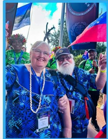
NEW ZEALAND "AIGA"