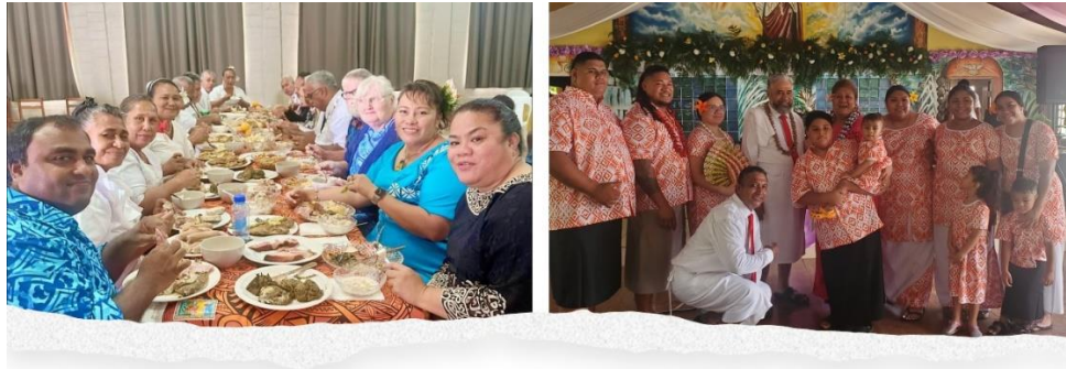
Friends and Fellowship – At His Word Ministries Faith Hope and Love Church – 10 year anniversary