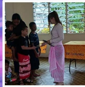
SVSG Juniors Event Family Ministry Balloons and more Balloons